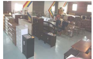
Upstairs houses new brand name and Amish made furniture