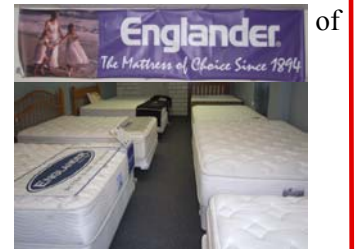
Newly remodeled Mattress Center

(now grown with families of their own) but to offer new and used furniture at affordable prices."